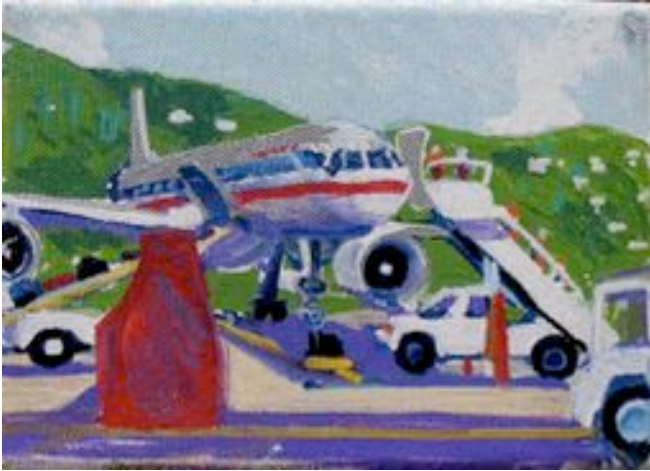
St. Thomas Boarding (paint markers)

“The markers are edgy and I like that they push the boundaries of what’s possible. ... They also make original art a little more affordable.”