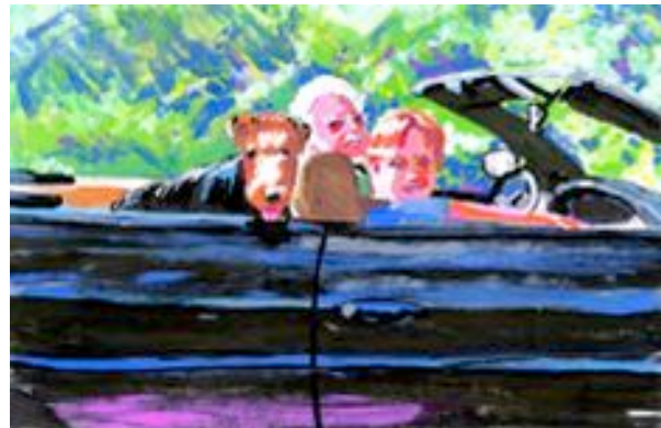
Parker's Parents (paint markers)

matches the constant stimulation and frenetic pace of a world where the most poignant moments could never be captured by traditional still life approaches. That the marker drawings appear simple to execute belies the years of study and disciplined practice that allow the artist to run wild across her sketchbook.