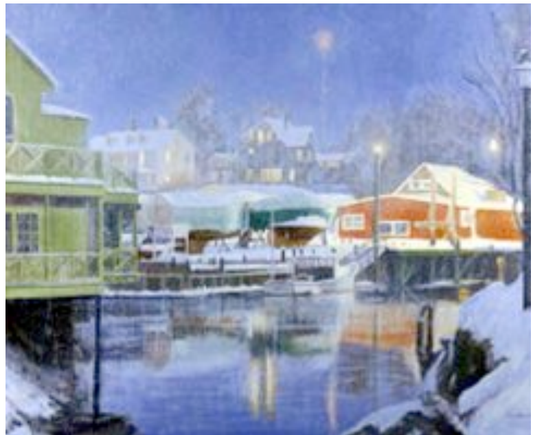
Winters Rest (oil on canvas)

“If there is just the tiniest crack, light always finds a way in. And there is so much light”