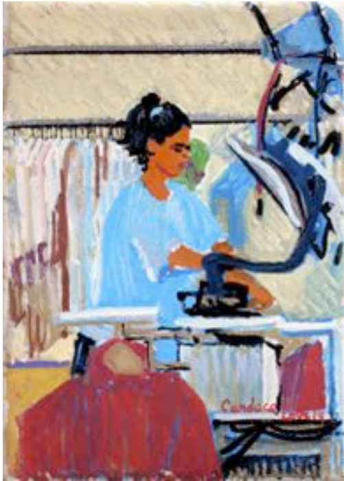
Pearl at the Clothes Press (paint markers)

“I don’t have that kind of disposable income to spend on art,” the artist admits. “Certainly people can buy prints that are quite good but there is something special about placing an original piece of art in your home. With the markers, original art becomes more affordable.”