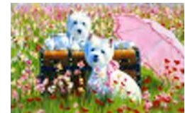
Cookies Please (oil on canvas)