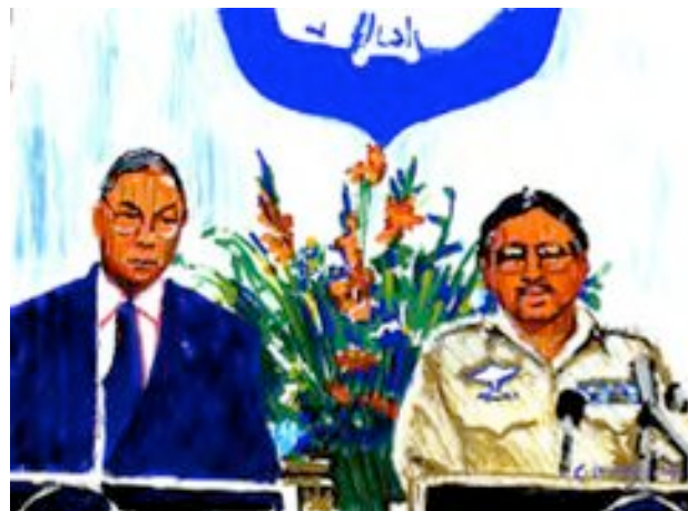
Colin Powell '01 (paint markers)

In today's world, no pilgrimage to Rome is required to become famous, nor allegiance to a royal family. Connection is an ubiquitous constant, raw information travels as elemental electric current, and fame is for the living ... for those who can dig deep into the present and match their energy to that of the world's and in doing so improve the world rather than